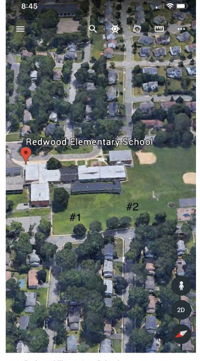
× Redwood Elementary School Elementary school in West Orange, New Jersey